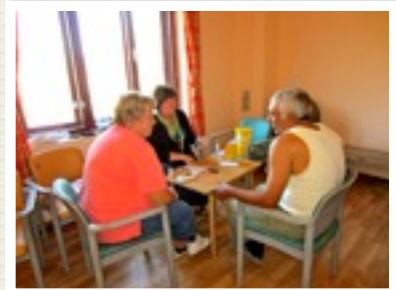
CONSULTATIONS IN SOARD