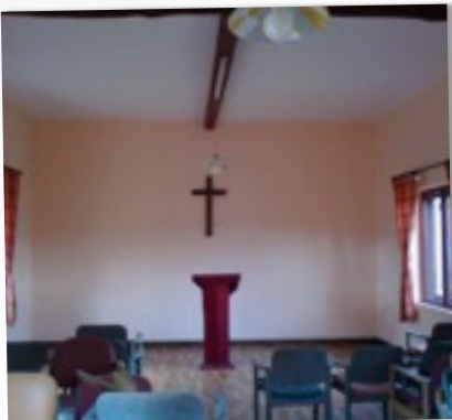
CHURCH IN SOARD RENOVATED