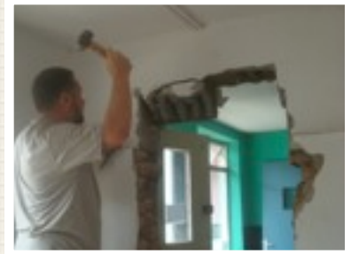
KNOCKING THRU TO WAITING ROOM